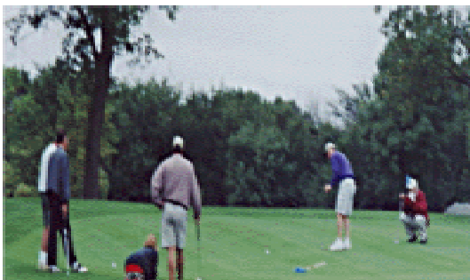
Residents enjoying the recreation along the Cottonwood River.