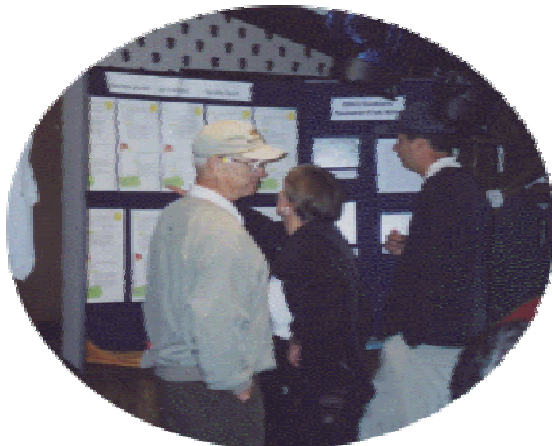
A golf team comparing their answers to the water quality quiz answers.