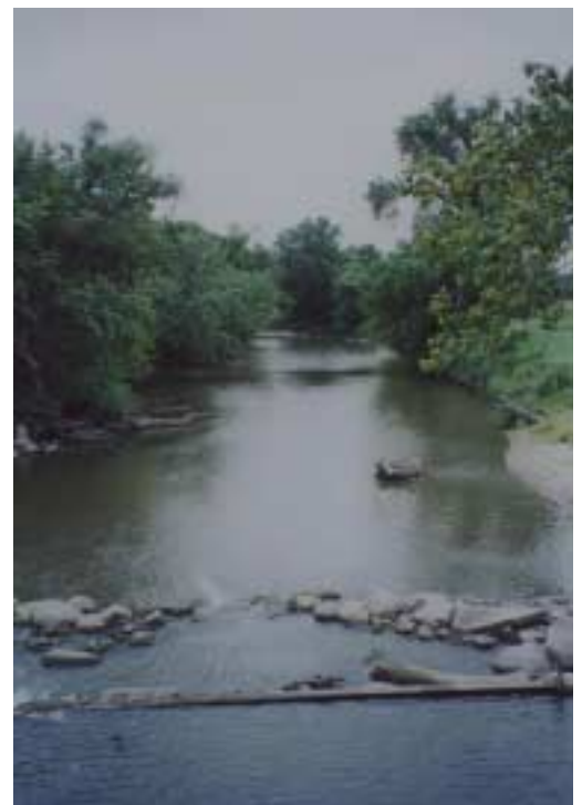
Overlooking the Cottonwood River from the bridge at the Farmer's Golf & Health Club in Sanborn.