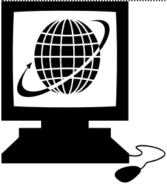
Photo contest winners from the first event are available for viewing on the RCRCA website! Information on the next photo contest is also available!

If you have any ideas about what you'd like to see on the web site, call 507-637-2142, Ext. 4. Suggestions can also be e-mailed to: shawn.wohnoutka@mn.nacdn.net