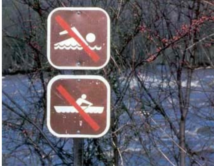
USDA Soil and Conservation Service

Phone: 507-637-2142, 4 Fax: 507-637-2134 Email: rcrca@rconnect.com