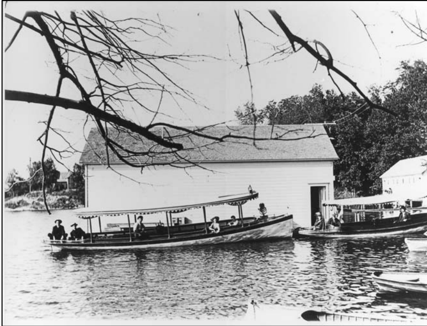
Figure 4 – Historic photograph of watercraft usage on Lake Redwood.