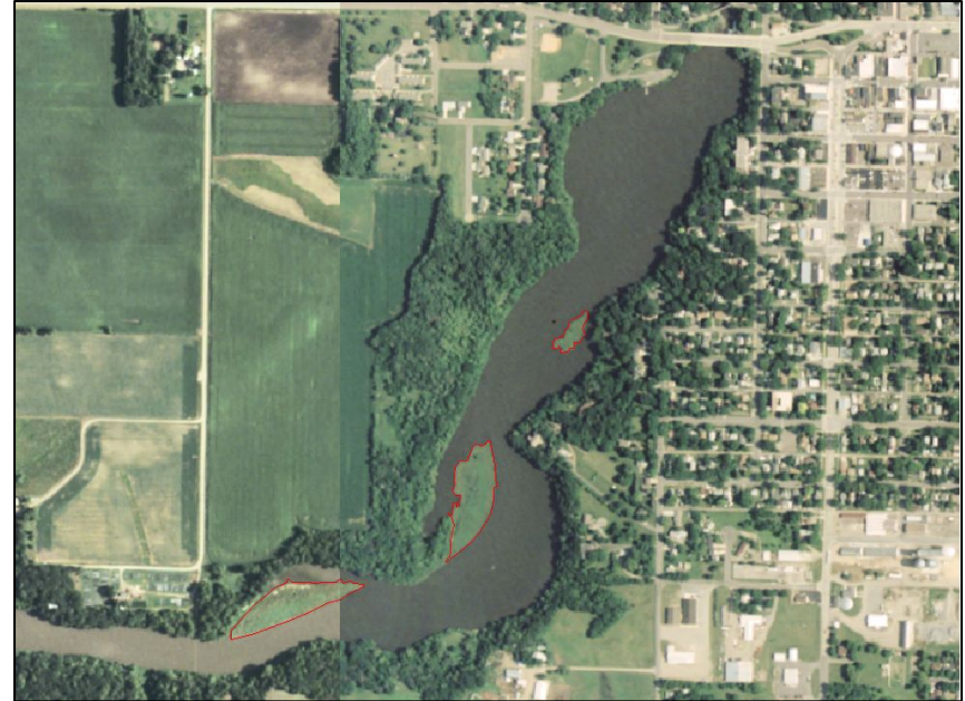
Figure 7 – Aerial photograph of Lake Redwood in 2006. (Note red outline of sandbar formations which have appeared due to shallow conditions.)