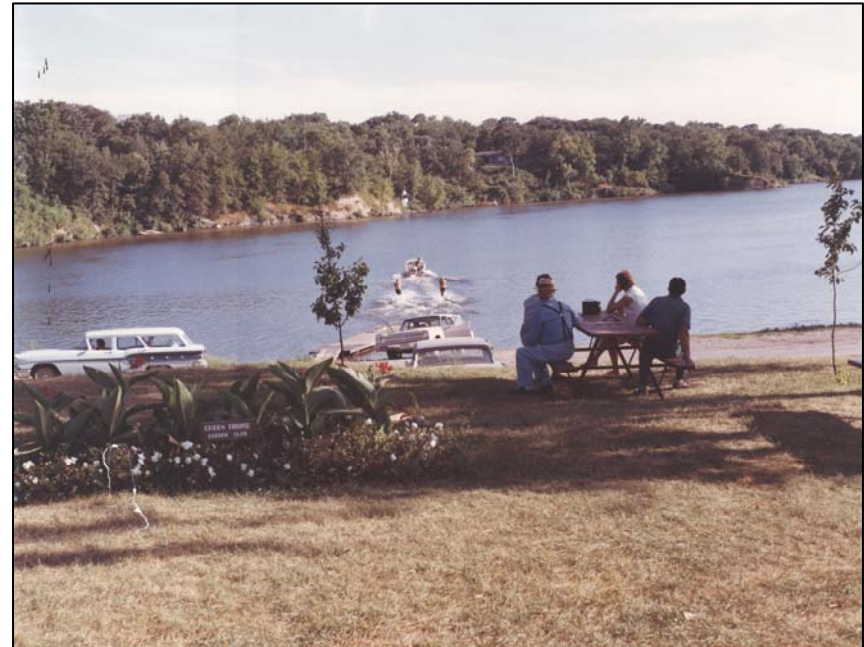
Figure 5 – Historic photograph of water skiing activity on Lake Redwood.