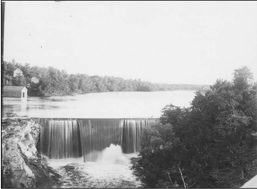
Figure 2 – Historic photograph of impoundment structure at Lake Redwood. (Note boat house in left background.)