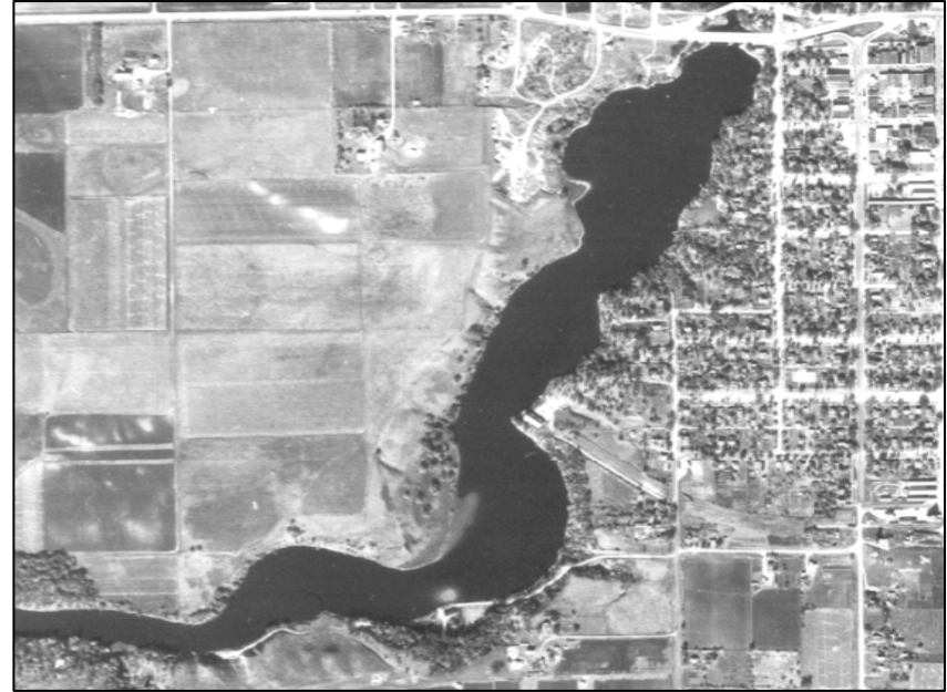
Figure 3 – Aerial photograph of Lake Redwood in 1938.