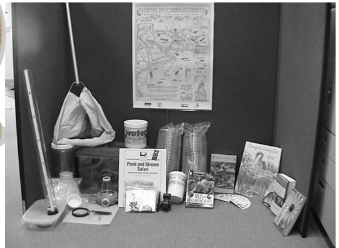
Stream trunk accessories: books, guides, sampling containers, holding tank, magnifying glasses, discovery scope, kick-net, T-tube, water quality sampling equipment and more!

If you are interested in learning more about the stream trunk, stop by the RCRCA office to take a look and ask questions. You can also call with questions or requests to check-out the stream trunk at 507-637-2142 Ext. 4.